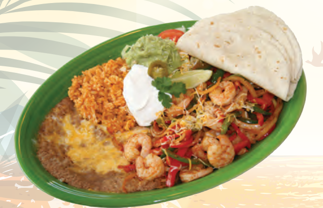
Shrimp Fajitas with Rice and Beans

Combo Fajitas $12.99 Vegetarian Fajitas $10.49