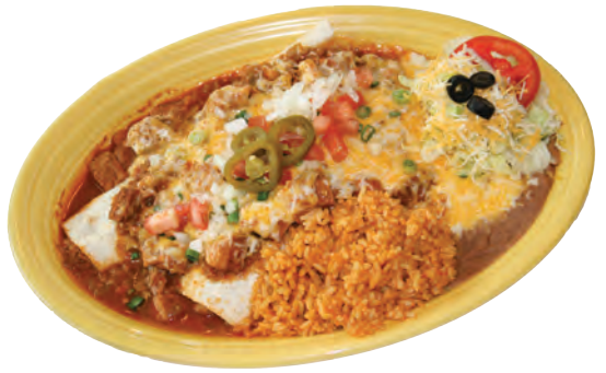
Smothered Verde Burritos with Rice and Beans

Two Chicken Tacos $7.99 Two Guacamole Tacos $7.99 Two Shredded Beef Tacos $ 8.99 Two Ground Beef Tacos $7,49