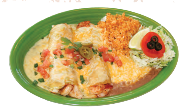
Seafood Enchiladas with Rice and Beans