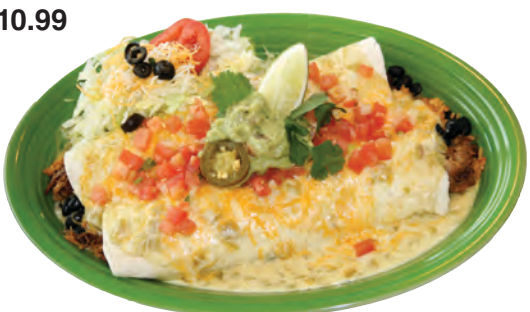
Carnita Burritos Especial