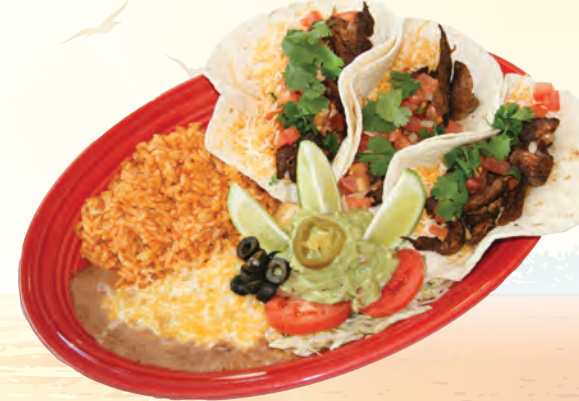
Carne Asada Taco with Rice and Beans